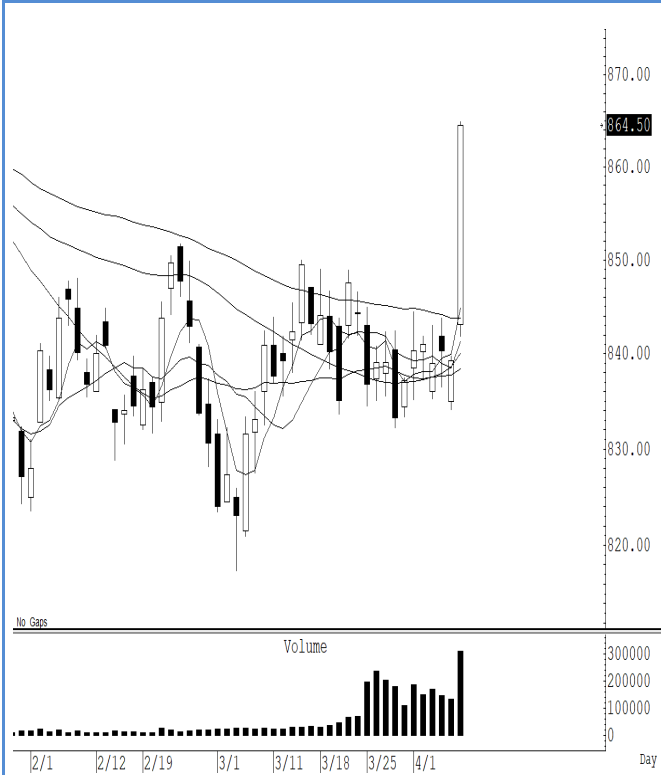
S50M24 (Close 864.50 Chg 25.20)